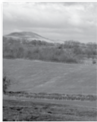
Countryside near Overdale Camp today

Overdale Camp was situated on the A59 (just past the turnoff for Embsay) near Skipton in North Yorkshire. It was Camp no. 60, holding both Italians and Germans. There was also a POW camp close to this site during the First World War. Although surrounded by barbed wire, the security was quite lax. Local children used to crawl under the wire and swap badges, etc. Some of the Italians were great craftsmen. They made cigarette lighters from old shell cases, using just a hammer and a nail and other odds and ends. Most of the prisoners worked in and around Skipton and quite a few stayed on after the War and had their families join them. Today the site is used as a caravan site, located just off the A6131.