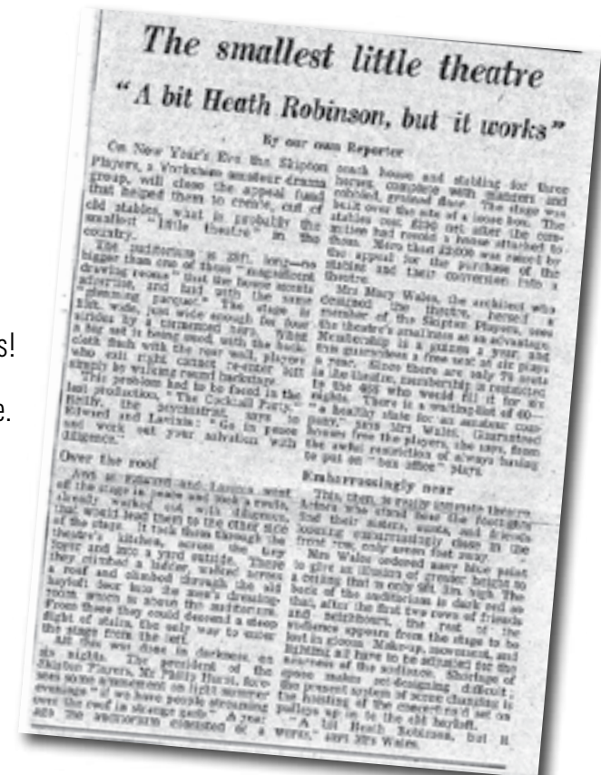
A press report from 1960