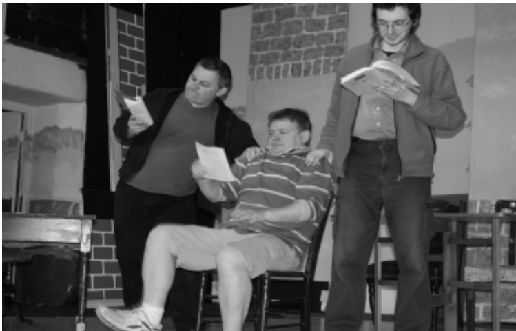
CHARLEY'S AUNT - EARLY REHEARSAL PHOTOGRAPH